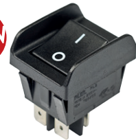
Lateral protection frame.